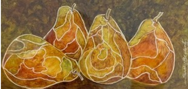
From Mary Oliver, for National Poetry Month