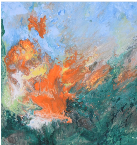
Butterfly Acrylic Monoprint 12" x 12" in gold metal frame